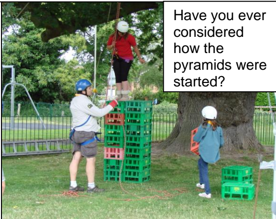
Have you ever considered how the pyramids were started?