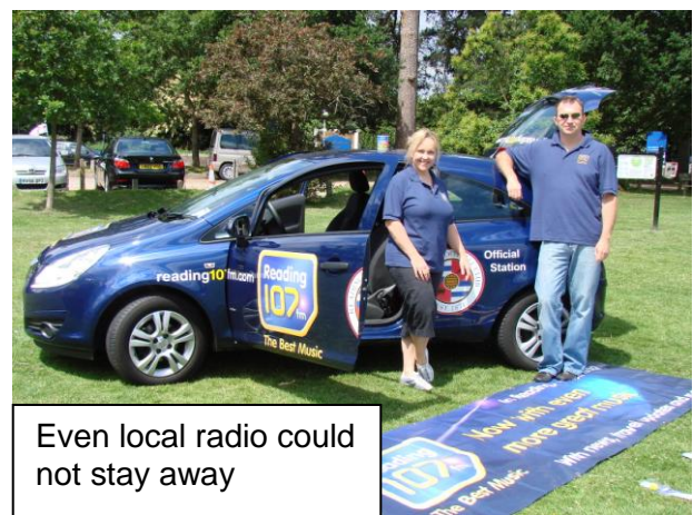
Even local radio could not stay away