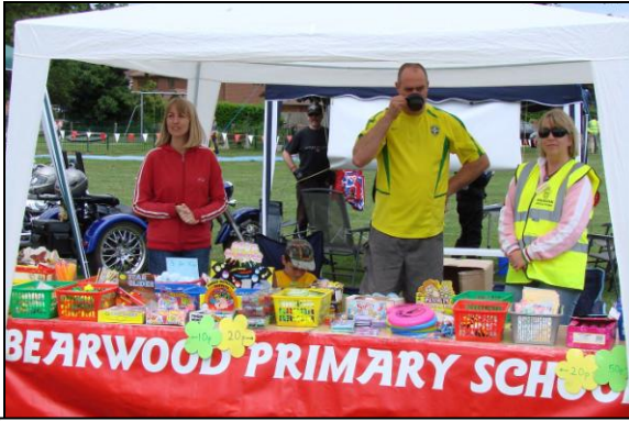
Bearwood Primary School raises funds for school projects

The annual Winnersh Village Fete saw a 30 per cent rise in the number of organisations that wanted to be involved and the numbers of people attending the event is rising steadily.