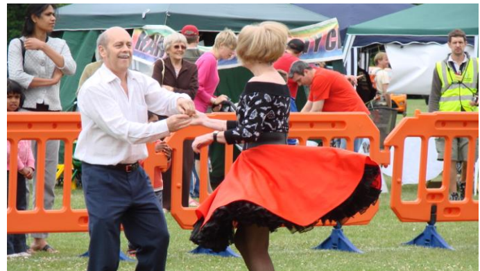
There was dancing and some of us were taken back to our youth. Contact the Parish Council to find out about classes and start a new lease of life this winter