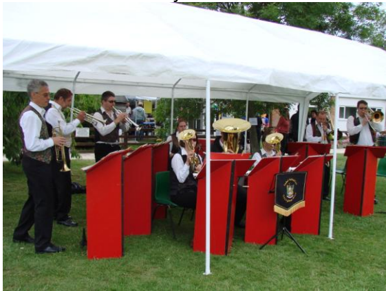
Big band music and plenty of brass was a real hit with everyone

Next year the fete will be on Saturday 18 June and the Parish Council plans to involve even more of our community in activities, competitions and exhibitions, so volunteer now before someone volunteers you later.