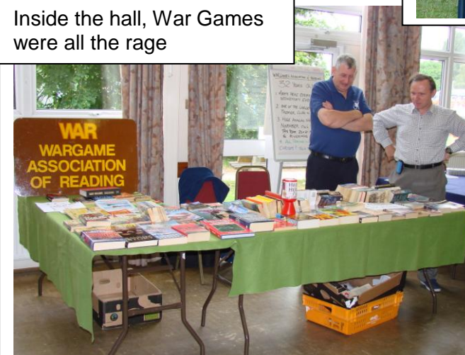
Inside the hall, War Games were all the rage