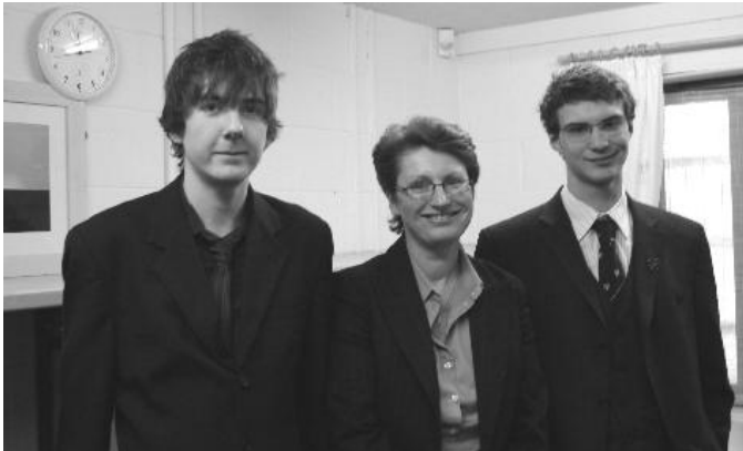
Your guides to cyber space!