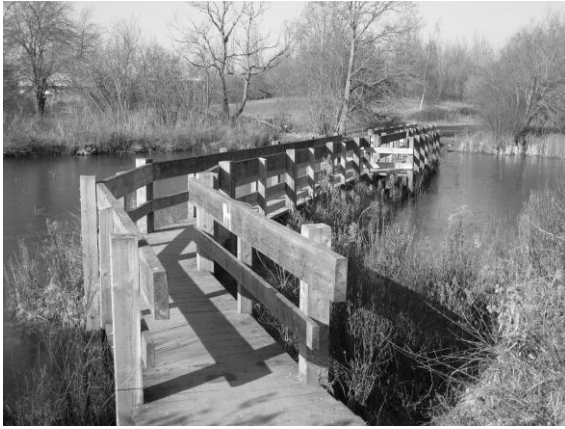
Arbor Meadows on a crisp February morning