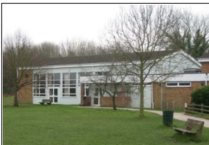
The Parish Council is based in the Community Centre, next to Bearwood Rec in Sindlesham

It also raises money through the parish precept, which people pay as part of their Council Tax bill. The annual precept for a Band D property in 2014/15 is £28.36.